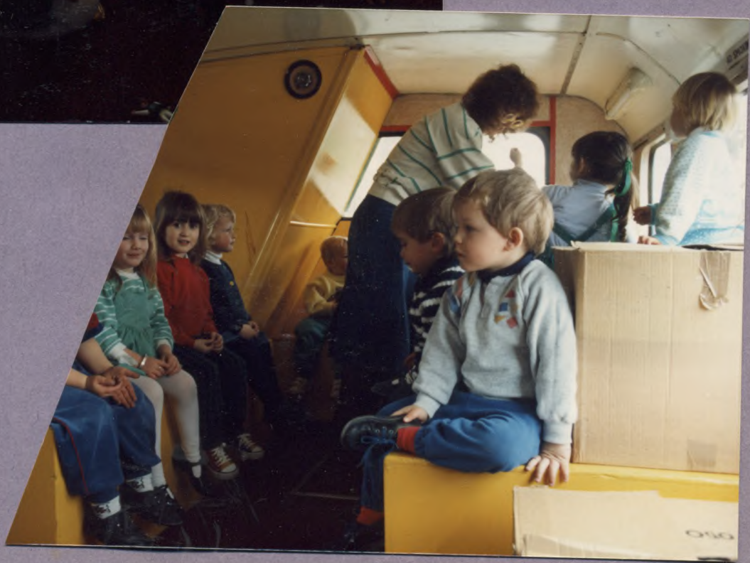
Shall we all sing "The wheels on the bus go round + round"