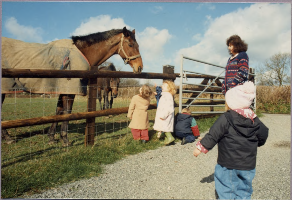
What a lovely horse.