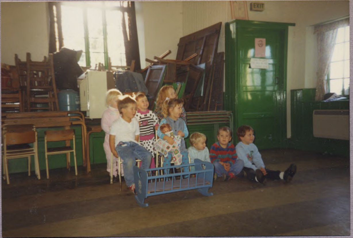
PRACTICE FOR NATIVITY PLAY.