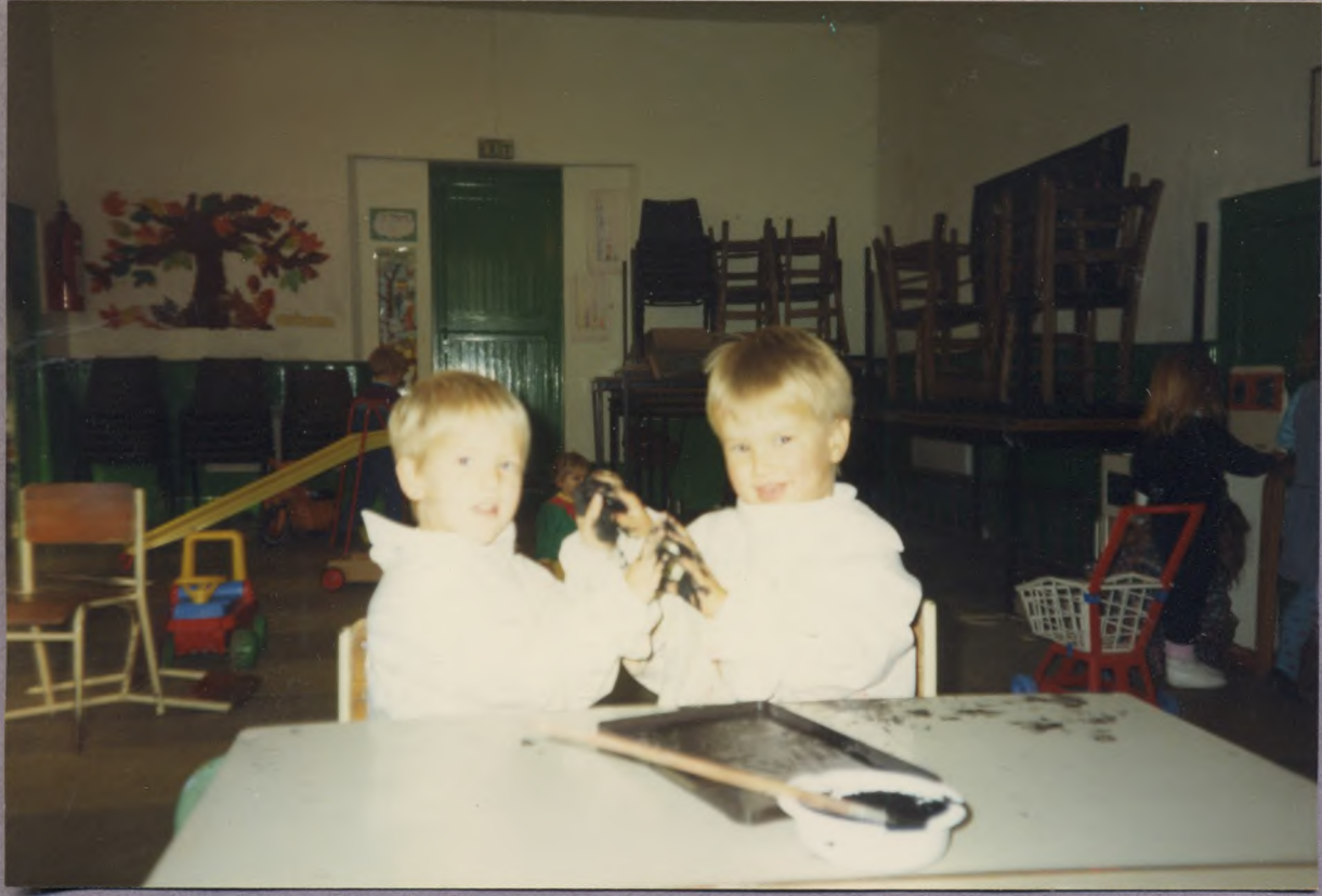
BLACK PAINT IS FUN WITHOUT A BRUSH