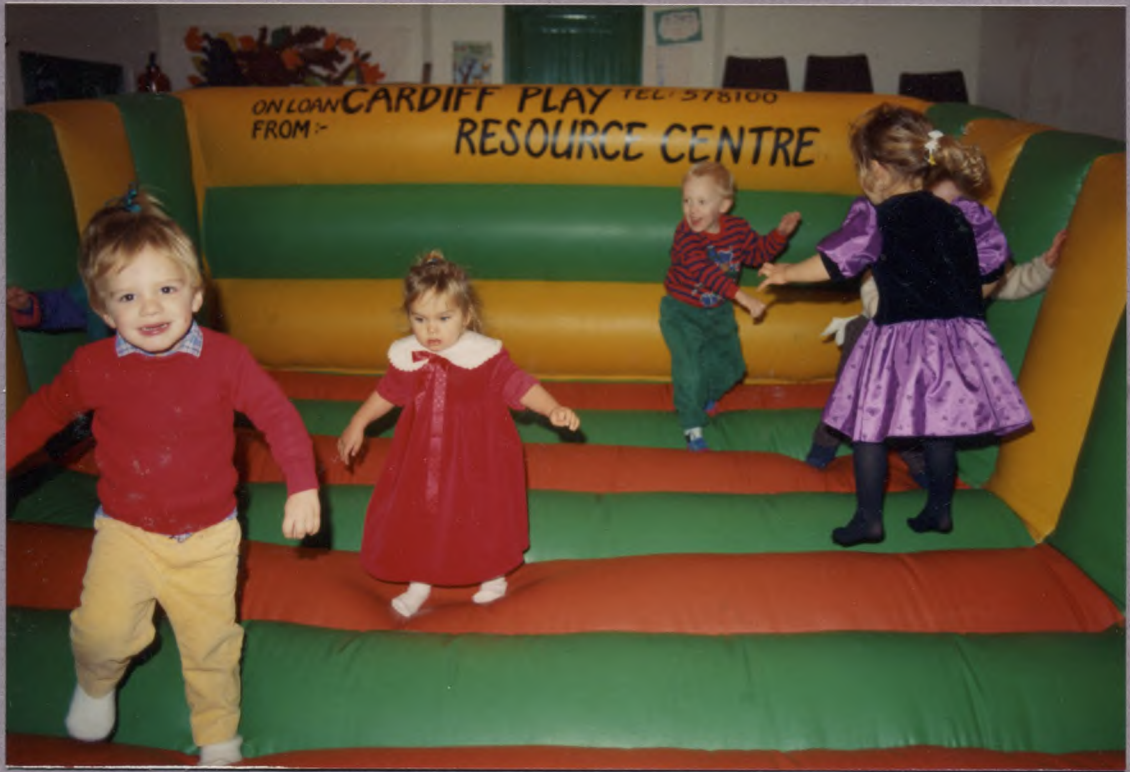
1990 Xmas Party