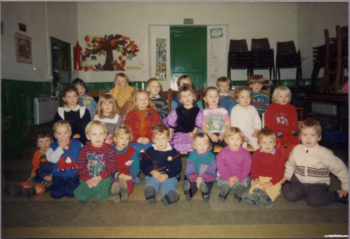
Group photo - xmas 1990