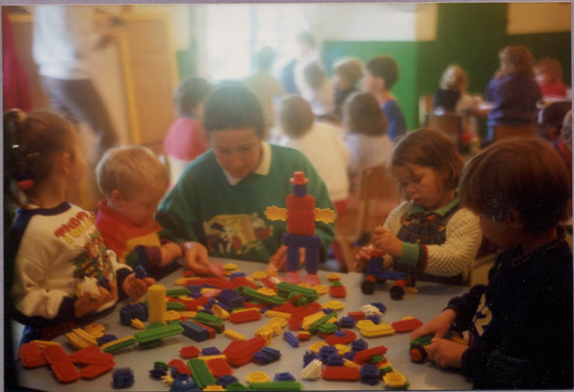
Fun in Playgroup.